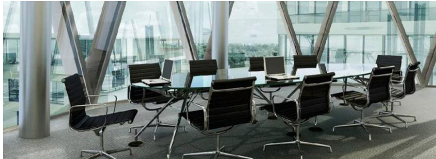
Sunny office space